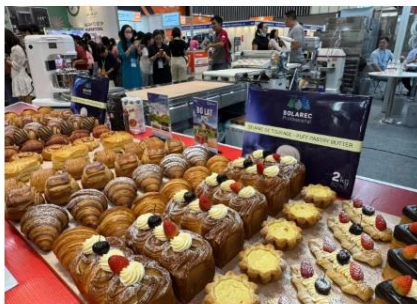
Delicious cakes are introduced at the VIBS 2024

The second Vietnam International Bakery Equipment Show (VIBS 2024) opened on December 11 at the Saigon Exhibition and Convention Centre in District 7 of Ho Chi Minh City.