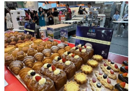
Delicious cakes are introduced at the VIBS 2024

VOV.VN - The second Vietnam International Bakery Equipment Show (VIBS 2024) opened on December 11 at the Saigon Exhibition and Convention Centre in District 7 of Ho Chi Minh City.