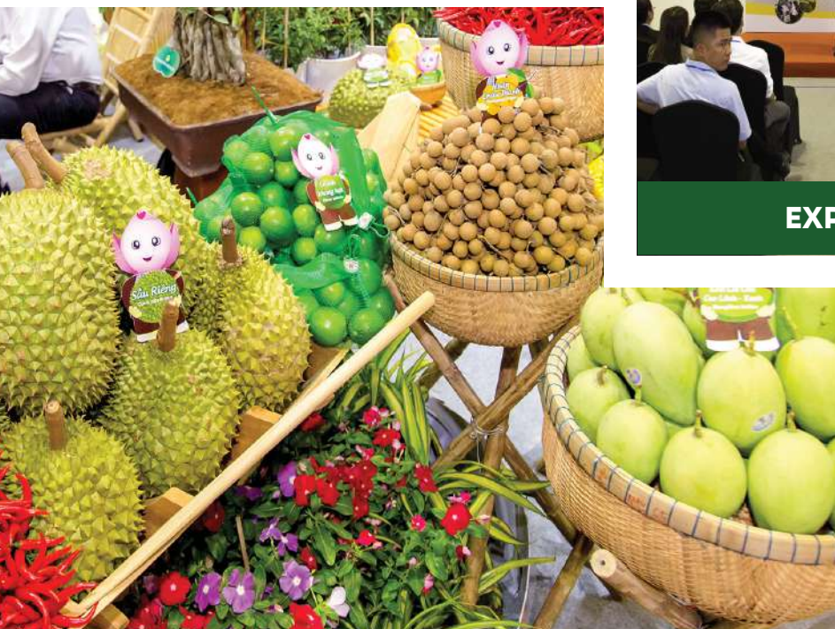
PREMIUM FRUIT SHOWCASE