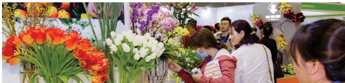
PREMIUM FLOWER SHOWCASE